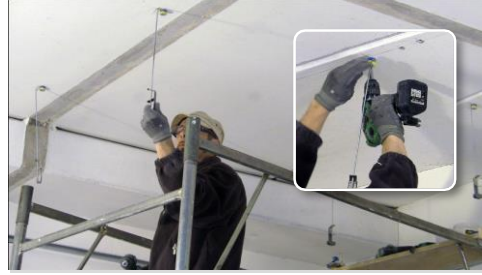
Mark and fix the acoustic hangers