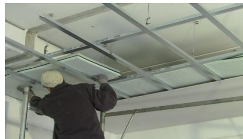
Place on top of the primary and secondary grid the insulation panels