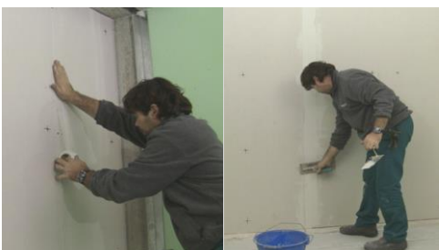
Apply the plastic mesh tape in the gypsum boards jointing lines and grouting