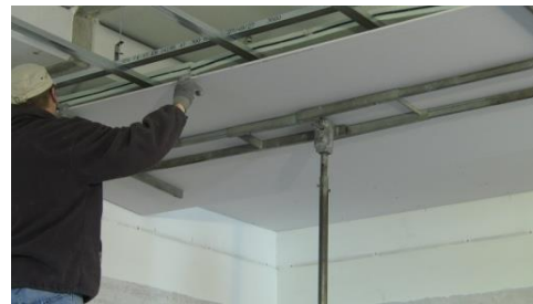
Lean the gypsum board to the metal frame. Fix the gypsum board by screwing