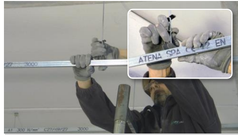
Fix to hangers the metal studs of primary grid