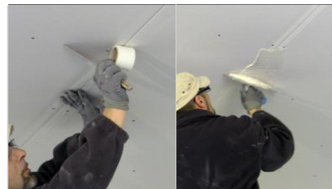
Apply the plastic mesh tape in the gypsum boards jointing lines. Apply the plastic mesh tape in the gypsum boards jointing lines