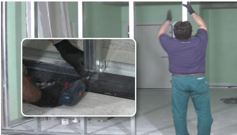
Fix the vertical metal studs on the ceiling and bottom guides by screwing