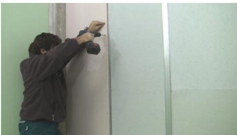
Cover the insulation layer by screwing the second gypsum boards on the metal studs