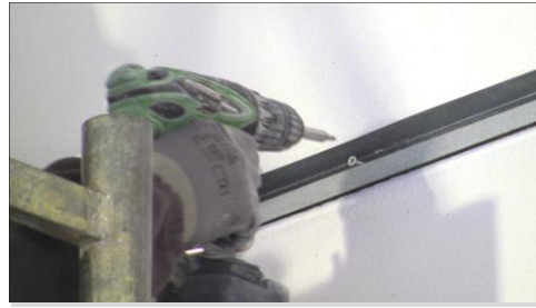
Fix metal stud along the perimeter of the room at a fixed distance from the ceiling