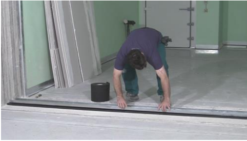
Fix metal stud on the floor, wall and ceilings