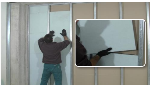
Fix the gypsum boards on one side. Insert the Fybro panel